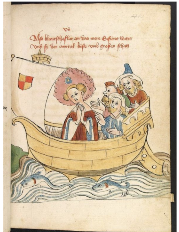
Image: Blancheflur at sea, UB Heidelberg cpg 362, fol. 48r (Diebolt Lauber Workshop)

In week 1, we will have a shorter organisational meeting.