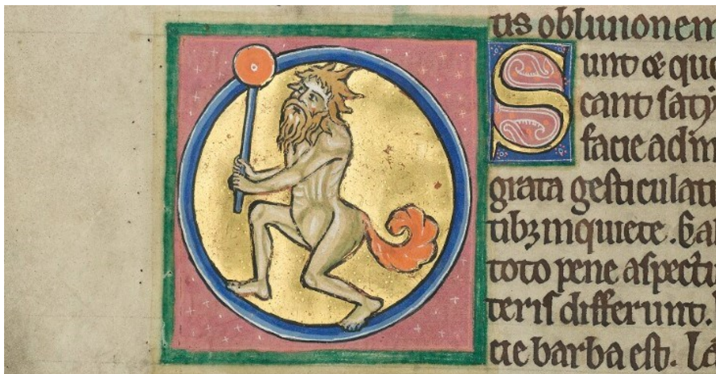
St John's College Oxford, MS. 61, fol. 15 v. Viewable in full at Digital Bodleian