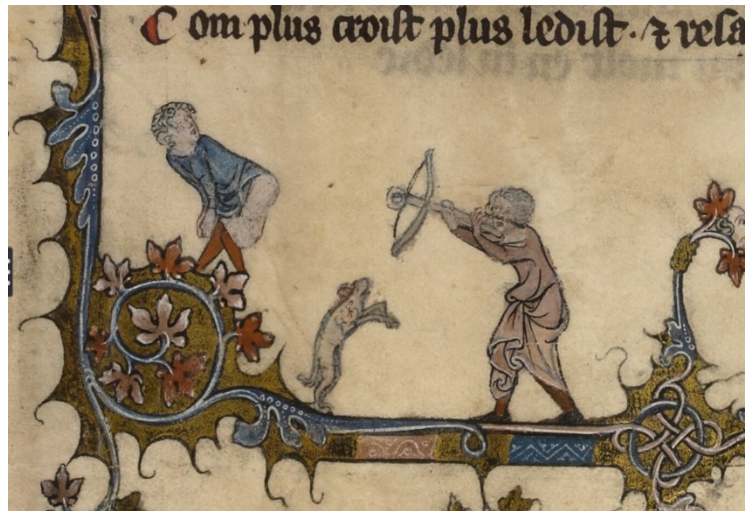
Bodleian Library MS Bodley 264, fol. 3r detail