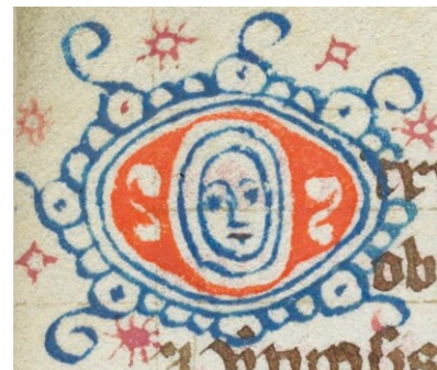
Bodleyan Libraries Oxford MS. Lat. liturg. f. 4, fol. 31r