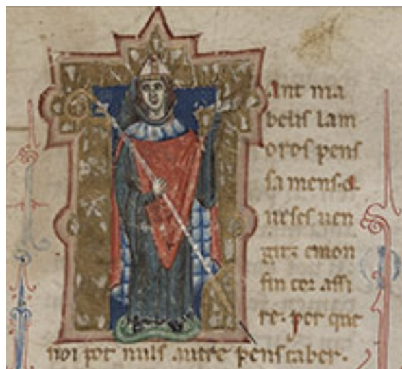
M. 819, f. 55r. Pierpont Morgan Library, New York. Catalogue Description: "Within initial T, Folquet de Marseille as bishop, wearing miter and fur-lined garment."

Trinity Term will be based around texts suggested by reading group members and will involve workshopping translations relevant to members' own interests. The group may also wish to explore the possibility of submitting a short translation for publication in a journal.